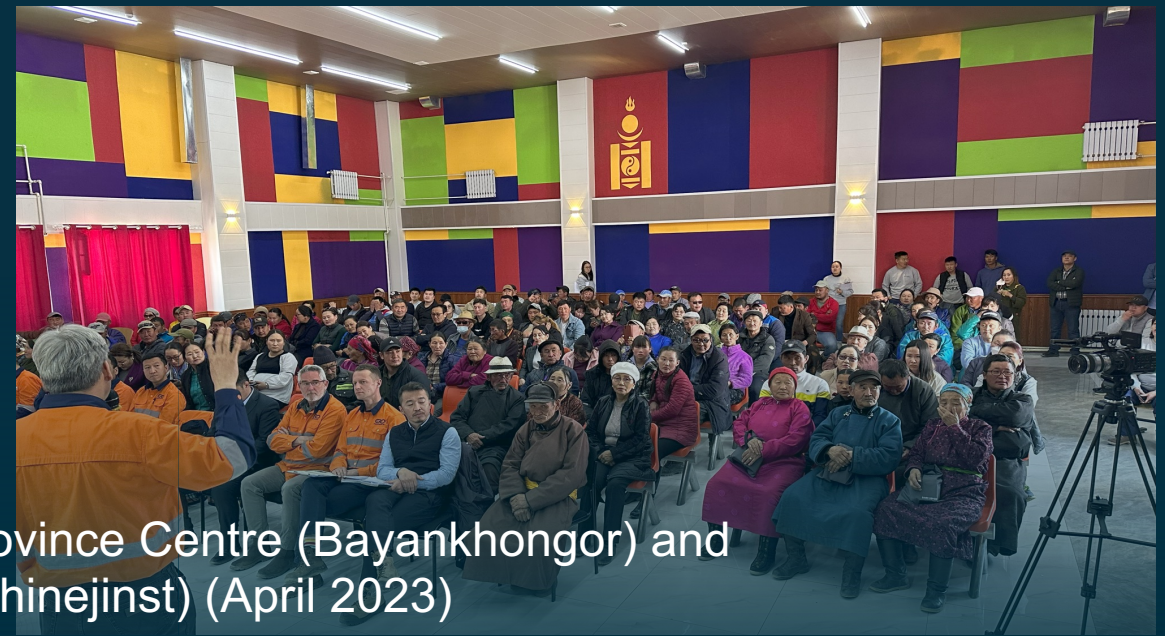
MMC & ERD CEO's Opening Representative Office in Province Centre (Bayankhongor) and Hosting an Open House Event in Sub-Province Centre (Shinejinst) (April 2023)