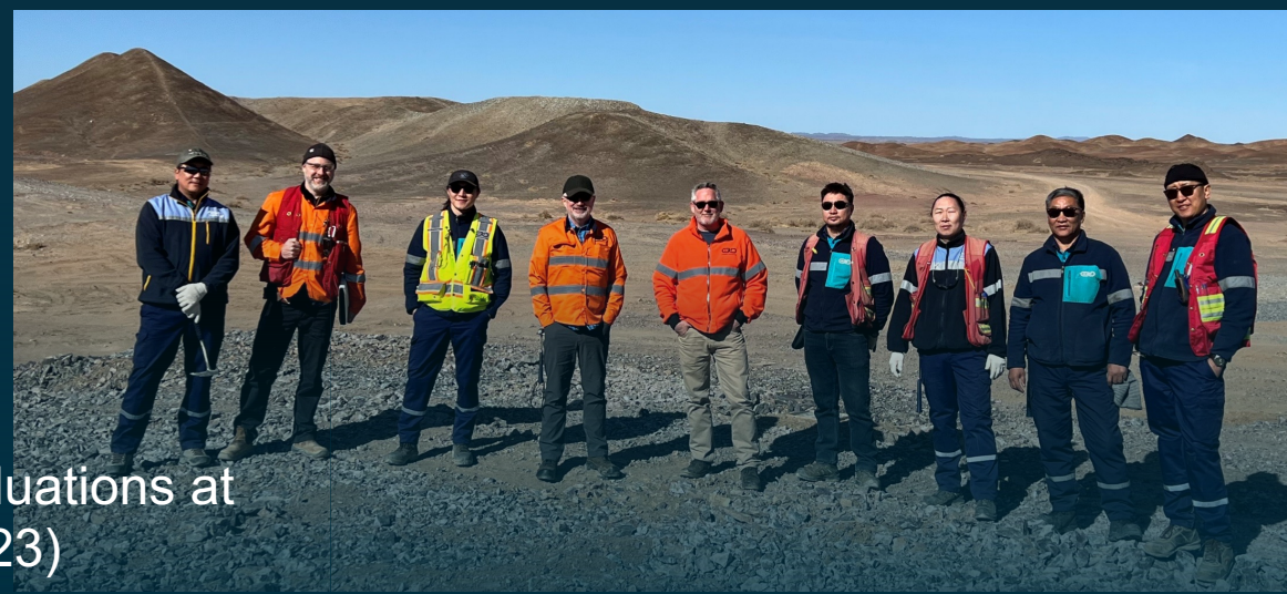
ERD Discovery Team Geologists Conduct Field Evaluations at Bayan Khundii, Dark Horse and Zuun Mod (April 2023)