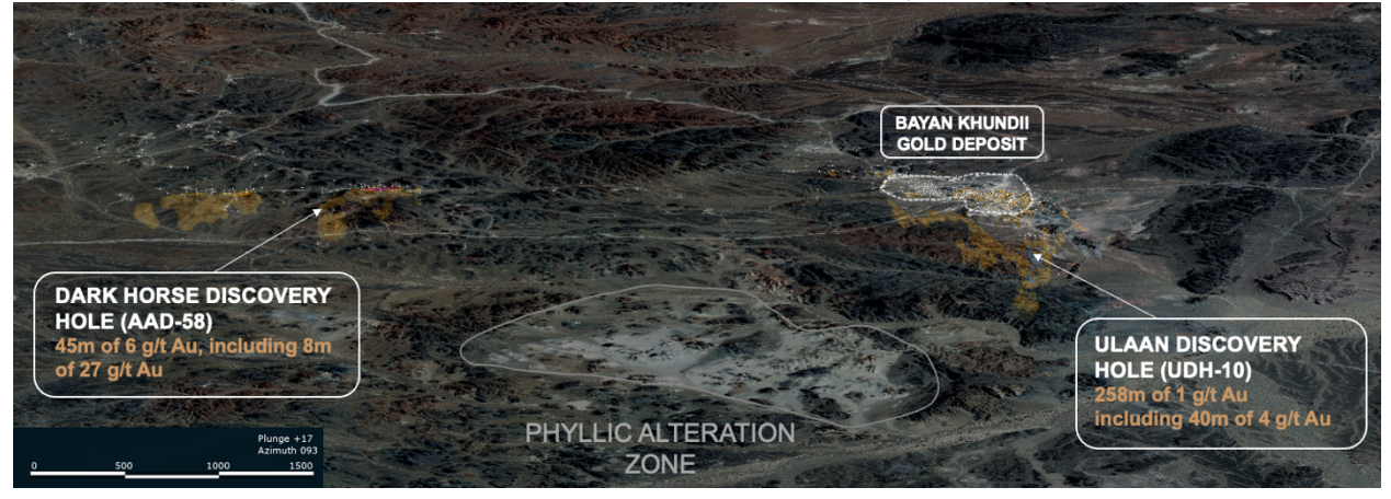
Figure 4: The Bayan Khundii Deposit Incorporating Ulaan and Dark Horse

Two Recent High-Grade Gold Discoveries Within 2.4 KM of Bayan Khundii