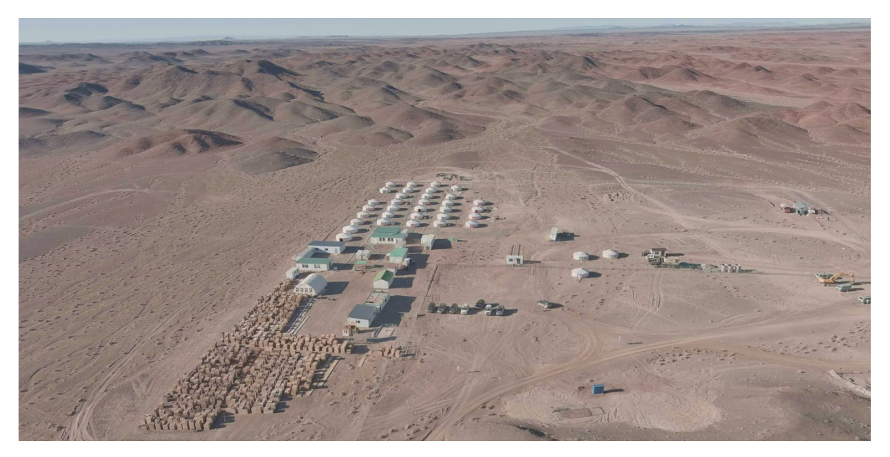
Figure 2: Bayan Khundii Construction and Exploration Facilities

We continue to work with Export Development Canada and other international financial institutions to secure the debt component of the BK Gold Project finance. This work is progressing well and is expected to be finalized following the delivery and final review of the updated FS. This debt financing, along with MMC's final investment of US$30 million, is expected to fully fund the BK Project to first gold.