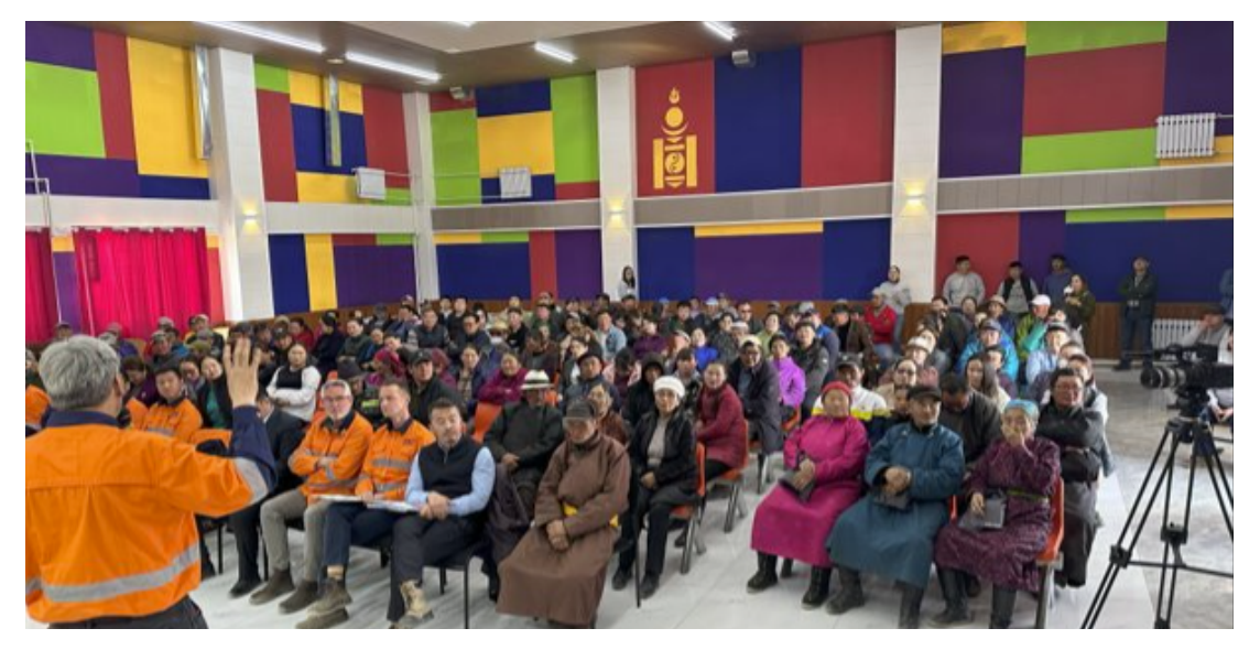
Figure 5: ERD-MMC Open House Shinejinst Community Centre

We are committed to making a difference in Mongolia, through shared benefits, transparency, and education. As the longest established foreign-owned mining company in the country, we have been part of Mongolia's development of a vibrant free-market economy which is true to its history and culture. During this time, we have witnessed the discovery, and recently the commissioning of the underground development, of the Oyu Tolgoi copper-gold mine, one of the worlds largest mineral deposits, demonstrating how modern mining can co-exist with Mongolia's rich history and culture.